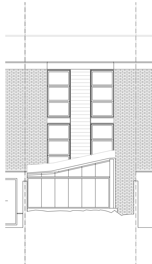
(00)250.01 Rear Elevation