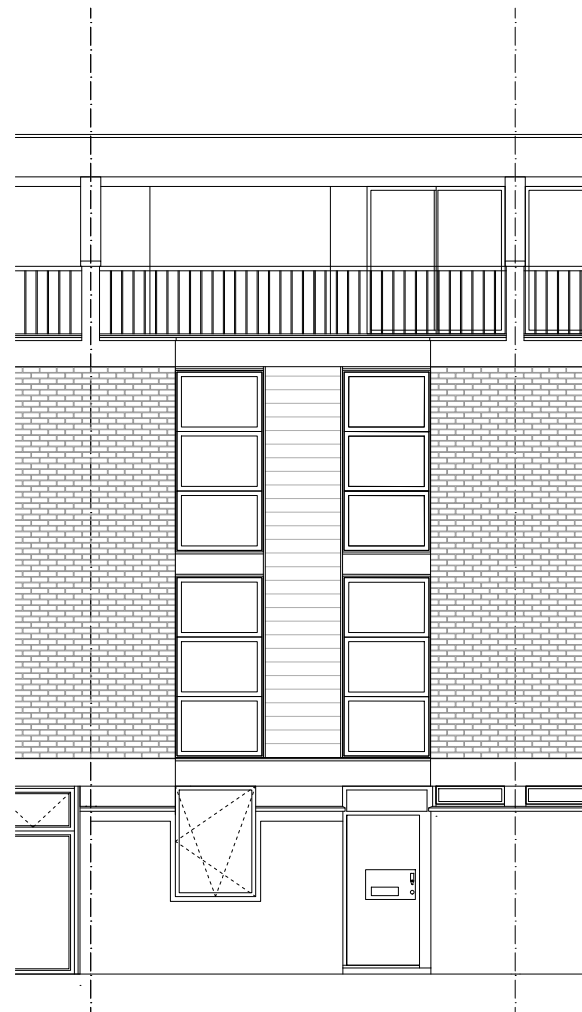
(00)250.01 Front Elevation