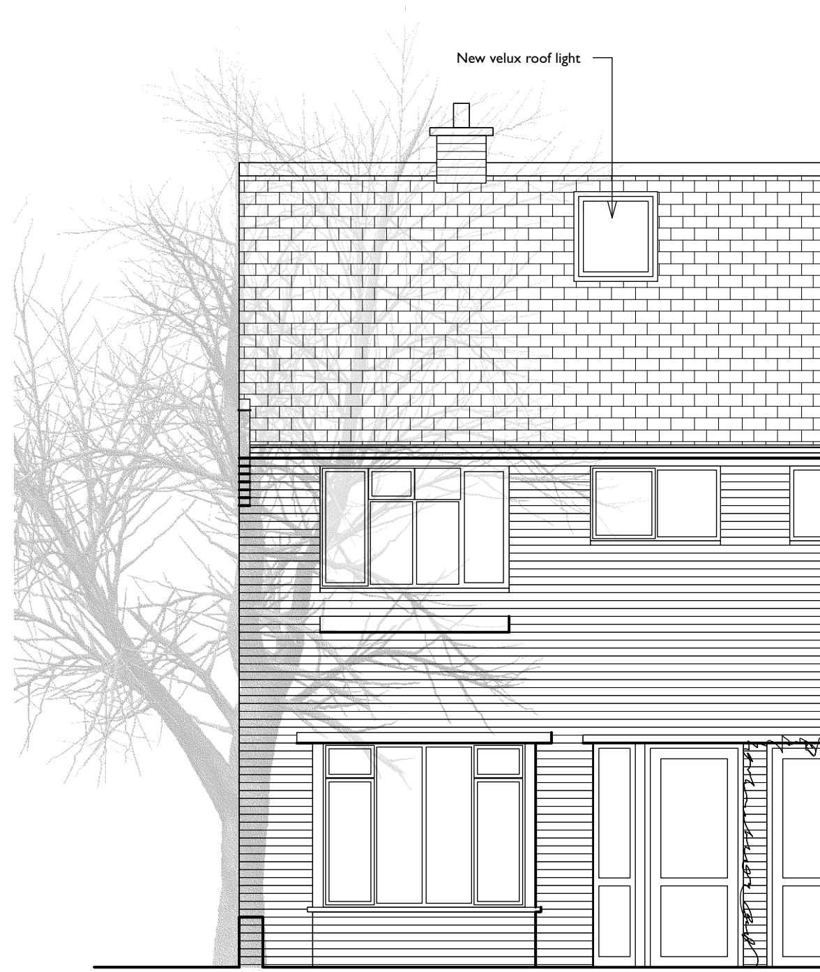
Front (Glenbrook Road) Elevation