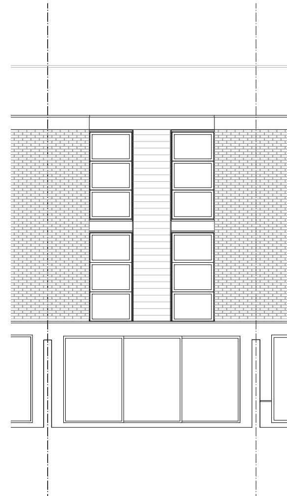
(00)250.01 Rear Elevation