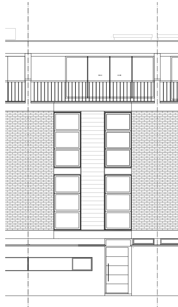
(00)250.01 Front Elevation