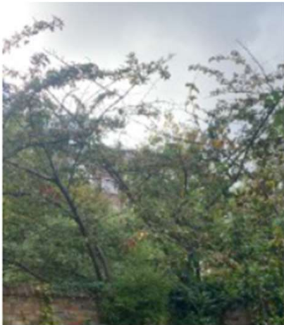
T4 - Tree Cotoneaster

The tree is right at the boundary wall. Risk of damaging wall and foundations