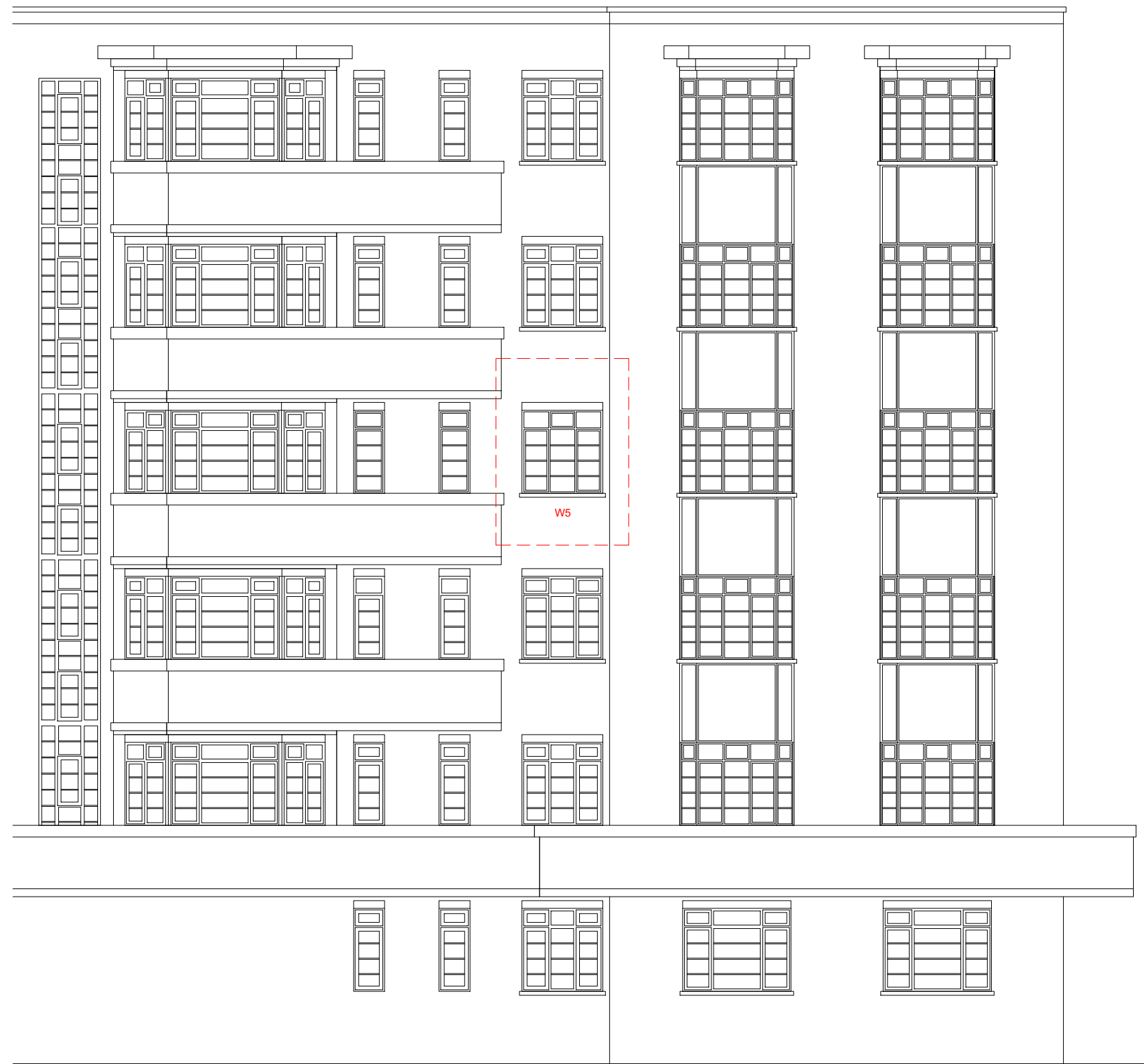
2 EXISTING NORTHWEST ELEVATION 1 : 25