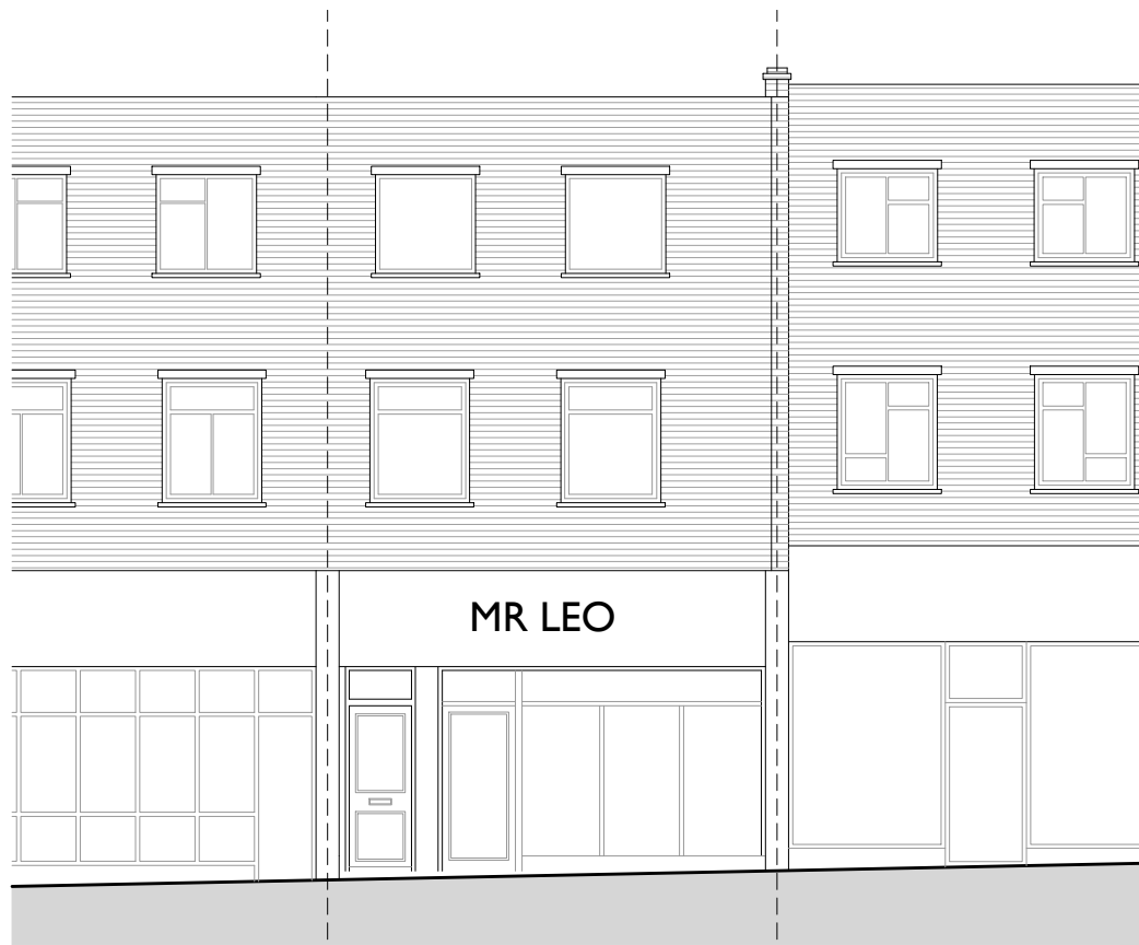
+EL Proposed north-east elevation - scale 1:100 at A3 Scale in Metres