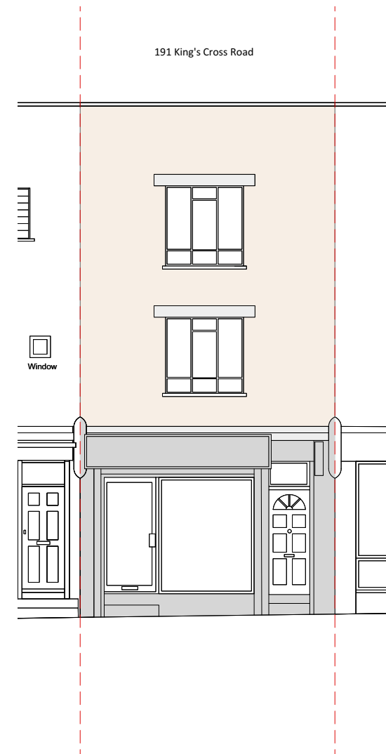
2 Existing Front Elevation EXT-2000 1:100@A3