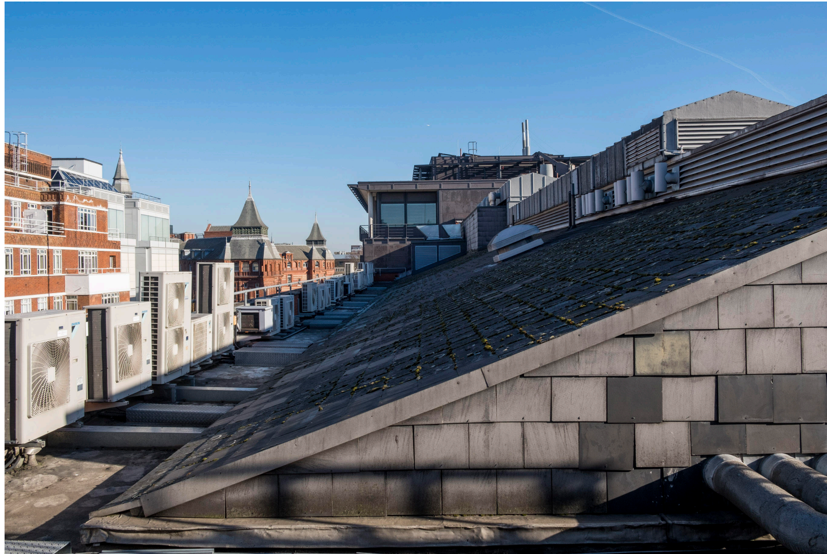
Further rooftop views..