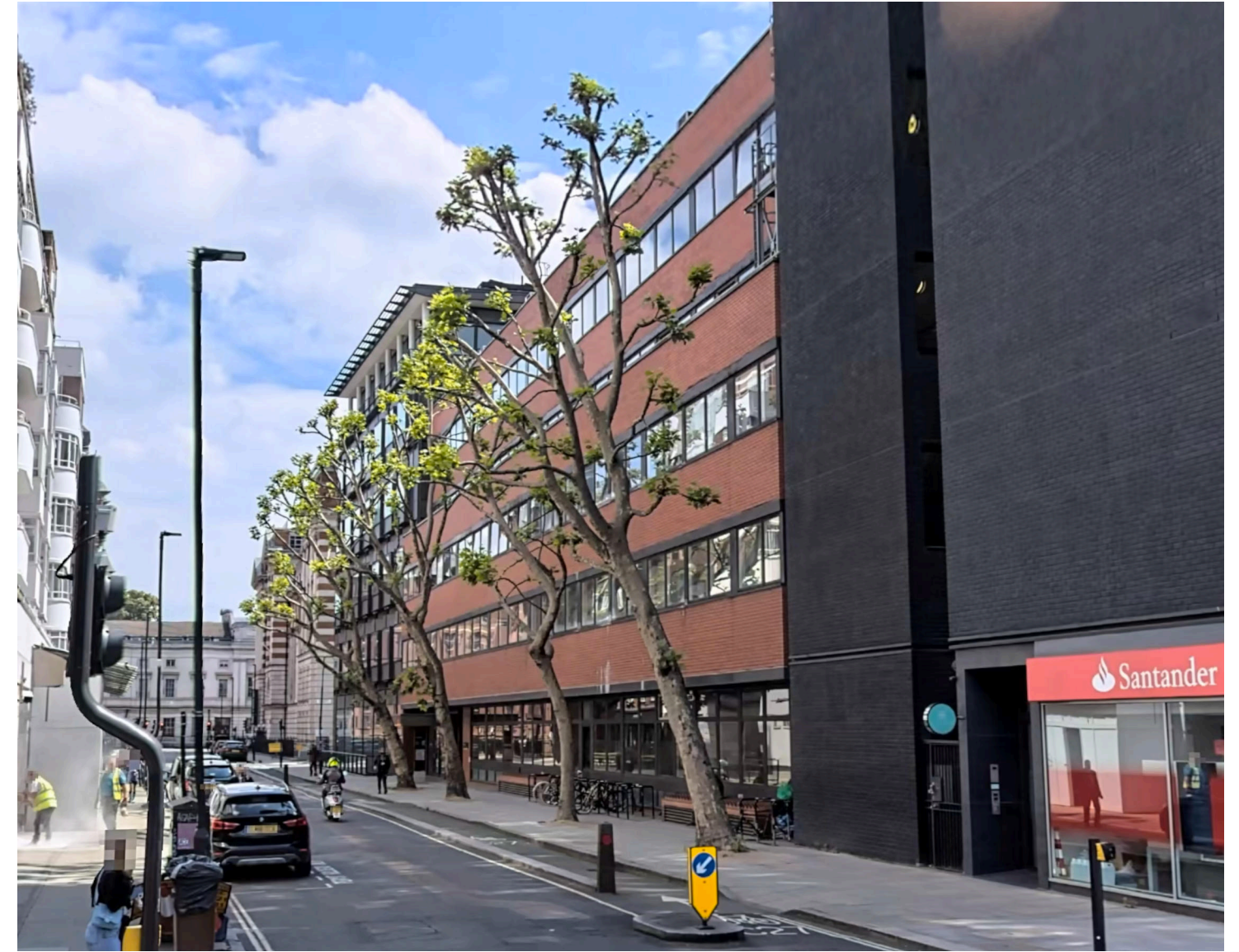
External views from University Street