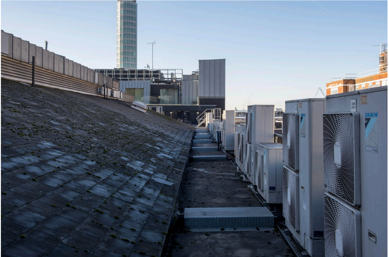
Right - rooftop views showing the extensive numbers of existing condensers/heat pumps. The pitched roof is the plant room.