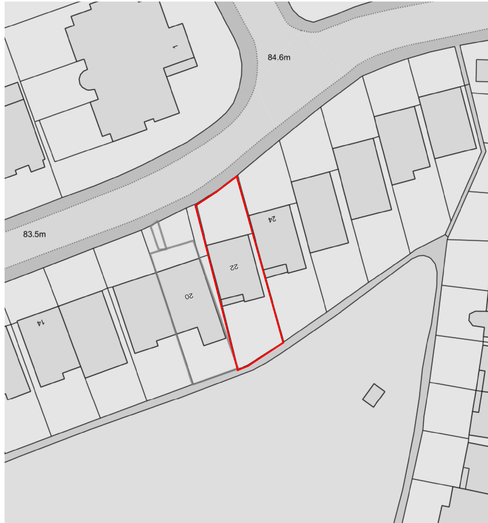
X EXISTING Block Plan 1:500@A3