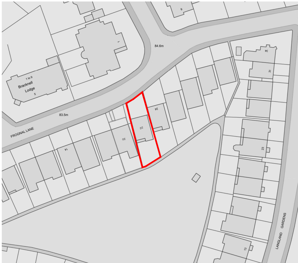
X EXISTING Site Location Plan 1:1250@A3