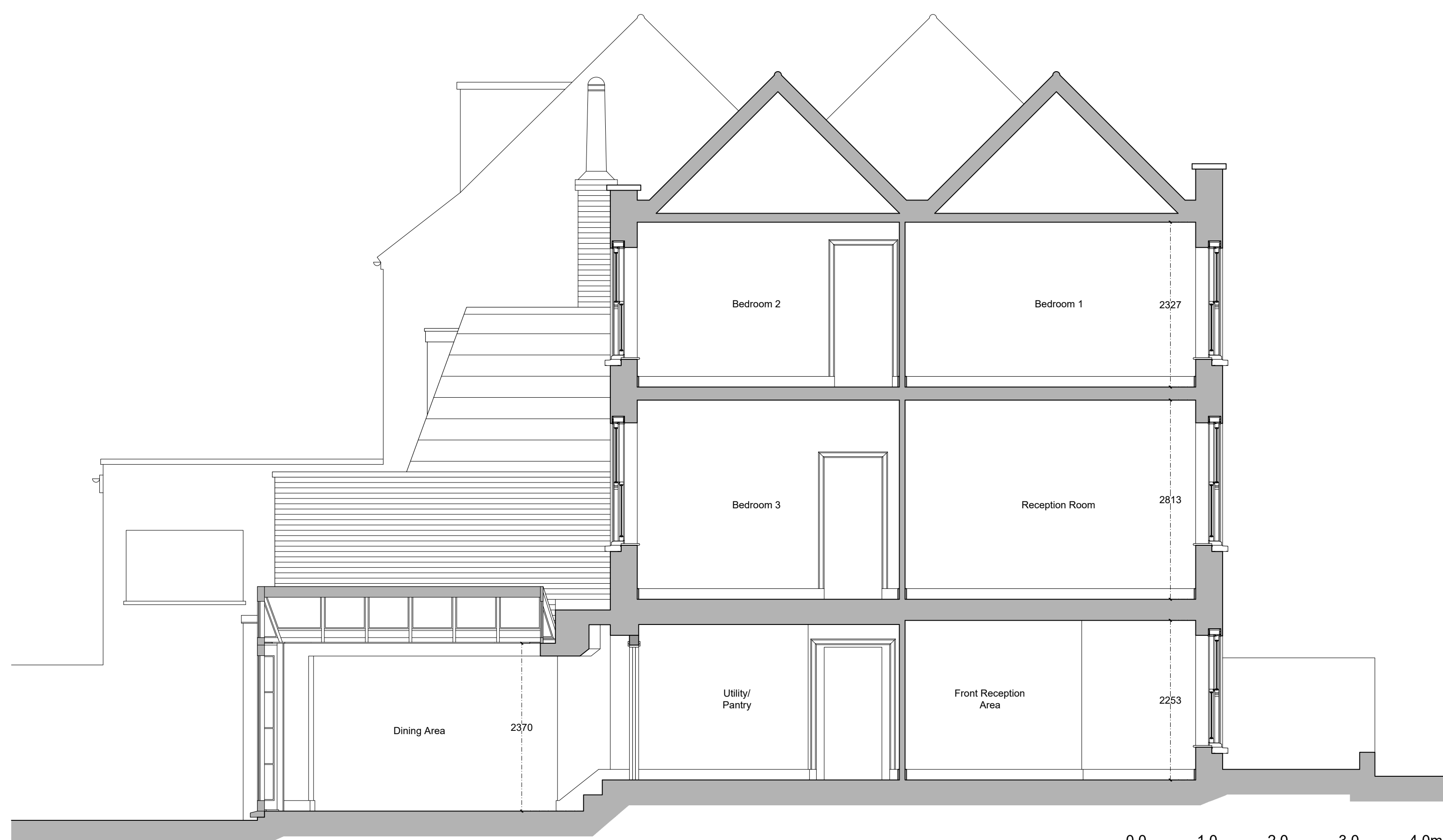
Proposed Section AA