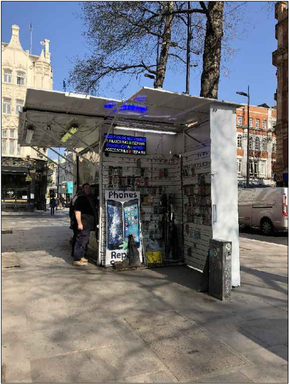
Right side - Open