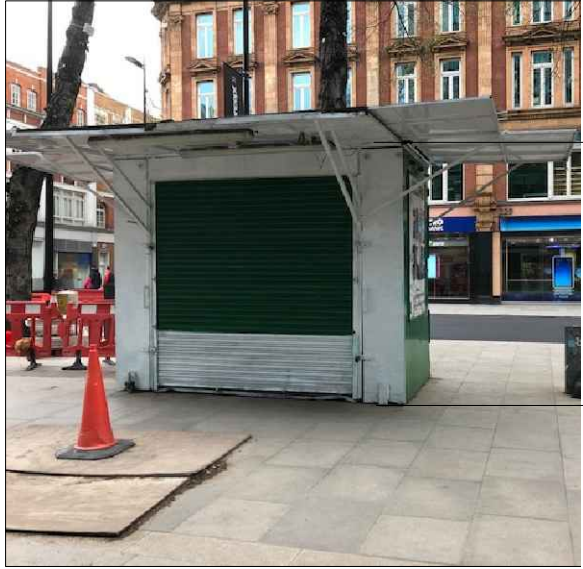
Front side - Closed

X:\JOBS\6191_WEP_WINDMILL SQUARE\7CAD\DRAWINGS\EXISTING KIOSK DRAWINGS\6191_PL003_EXISTING KIOSK.DWG