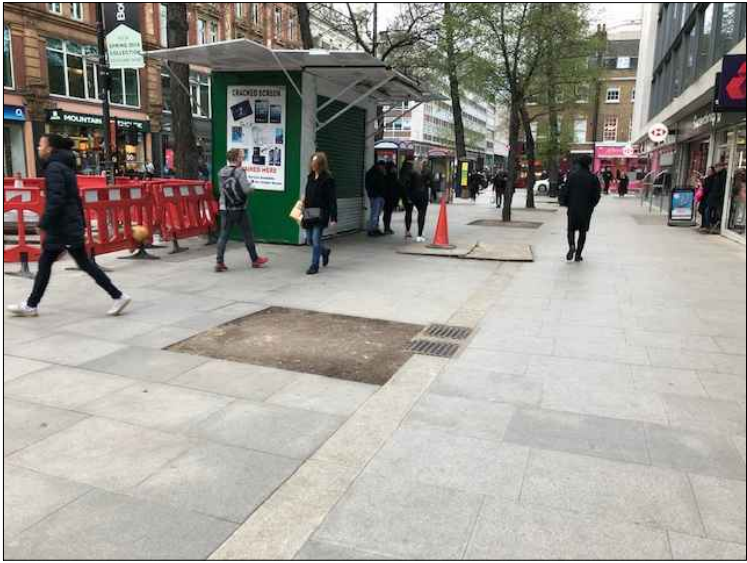
Left side - Closed