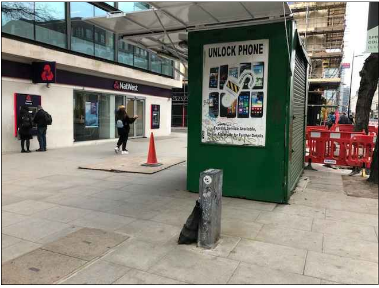
Right side - Closed