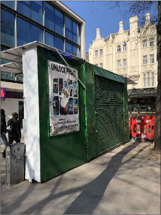
Rear side - Open