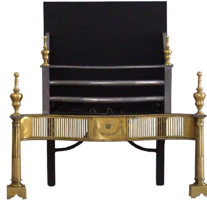
PROPOSED GROUND FLOOR BASKET LIVING/DINNING ROOM