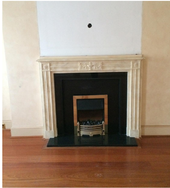
EXISTING GROUND FLOOR FIREPLACE - SCALE 1:20 @ A3 FRONT DAY RM / DINING RM FIREPLACE