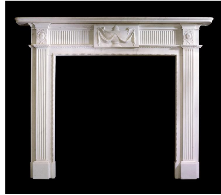
PROPOSED GROUND FLOOR FIREPLACE LIVING/DINNING ROOM

Black Slate Back Hearth Black Slate Slips to suit 40" opening fireplace, Cararra marble surround sizes to be proportional and to match as close as possible to exist.