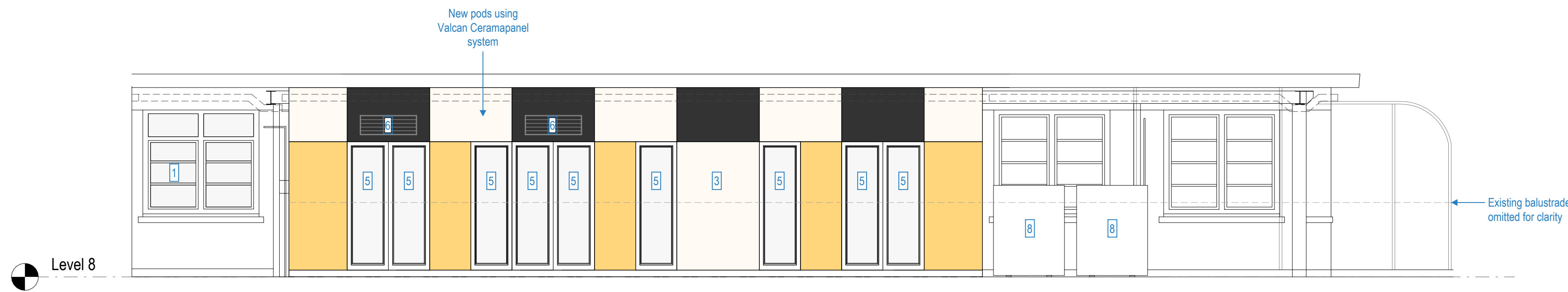
4 3253 Pod West Elevation 11 - Wing B 1 : 50