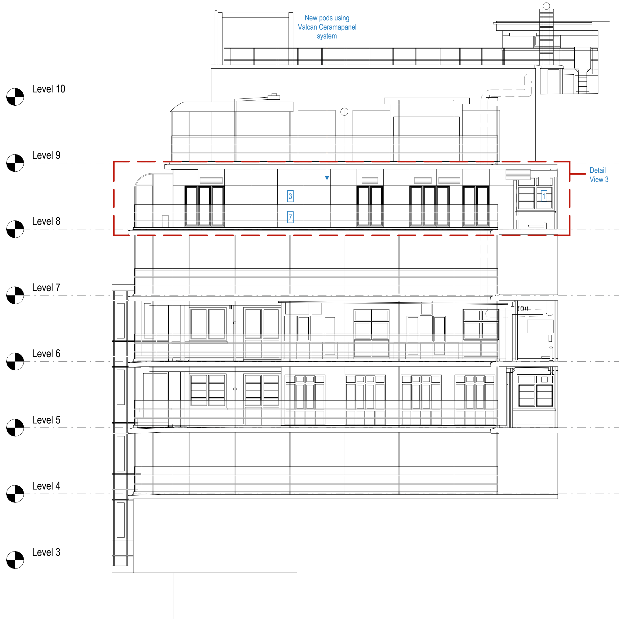
1 3253 East Elevation 9 1 : 100