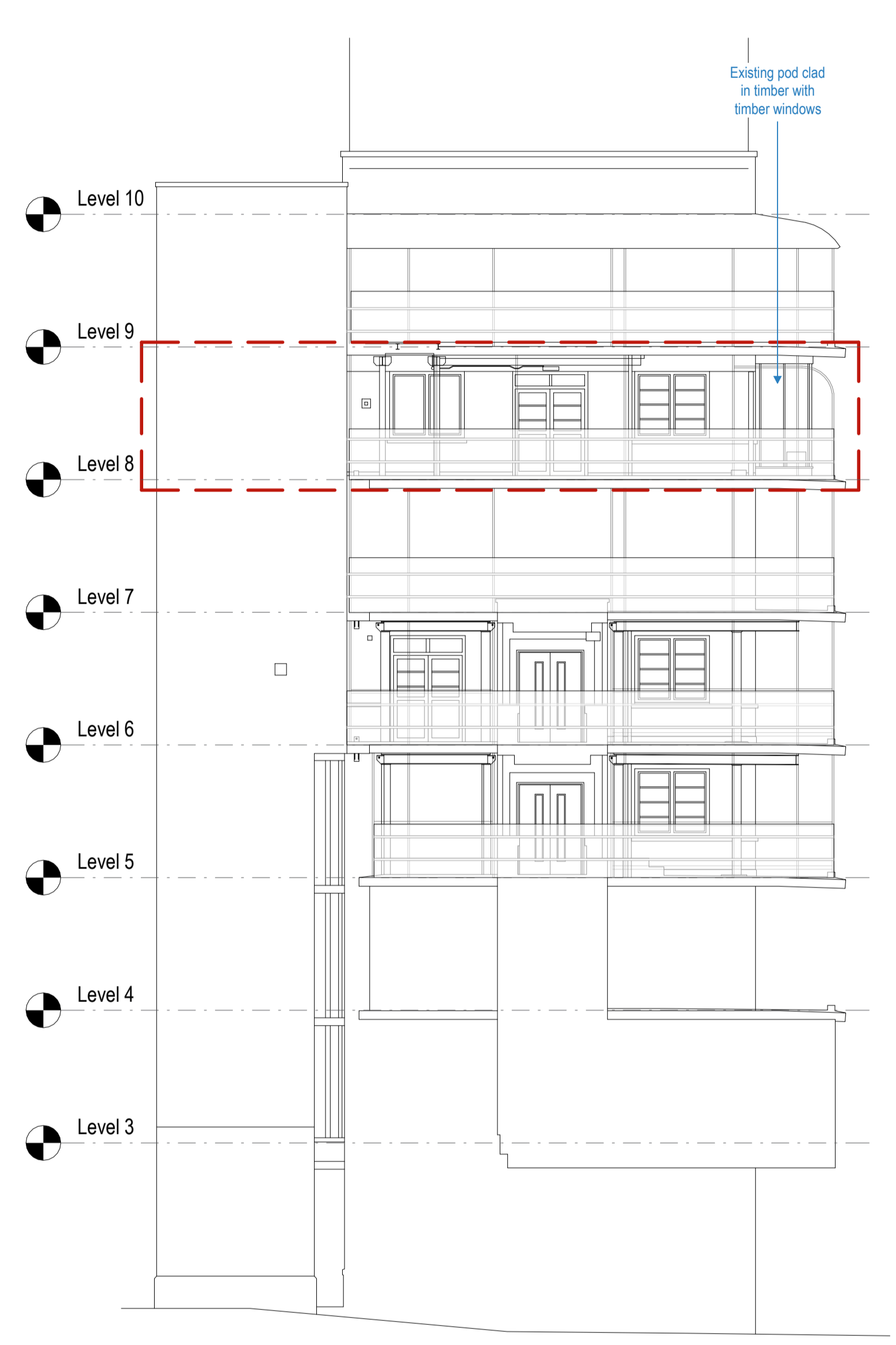
2 South Elevation 8 3054 1 : 100