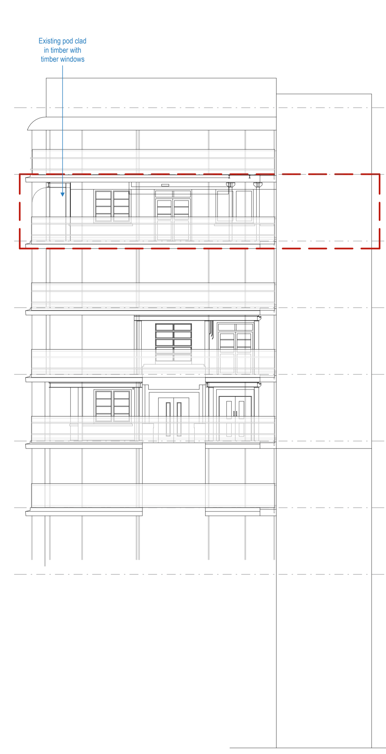
4 South Elevation 12 3054 1 : 100