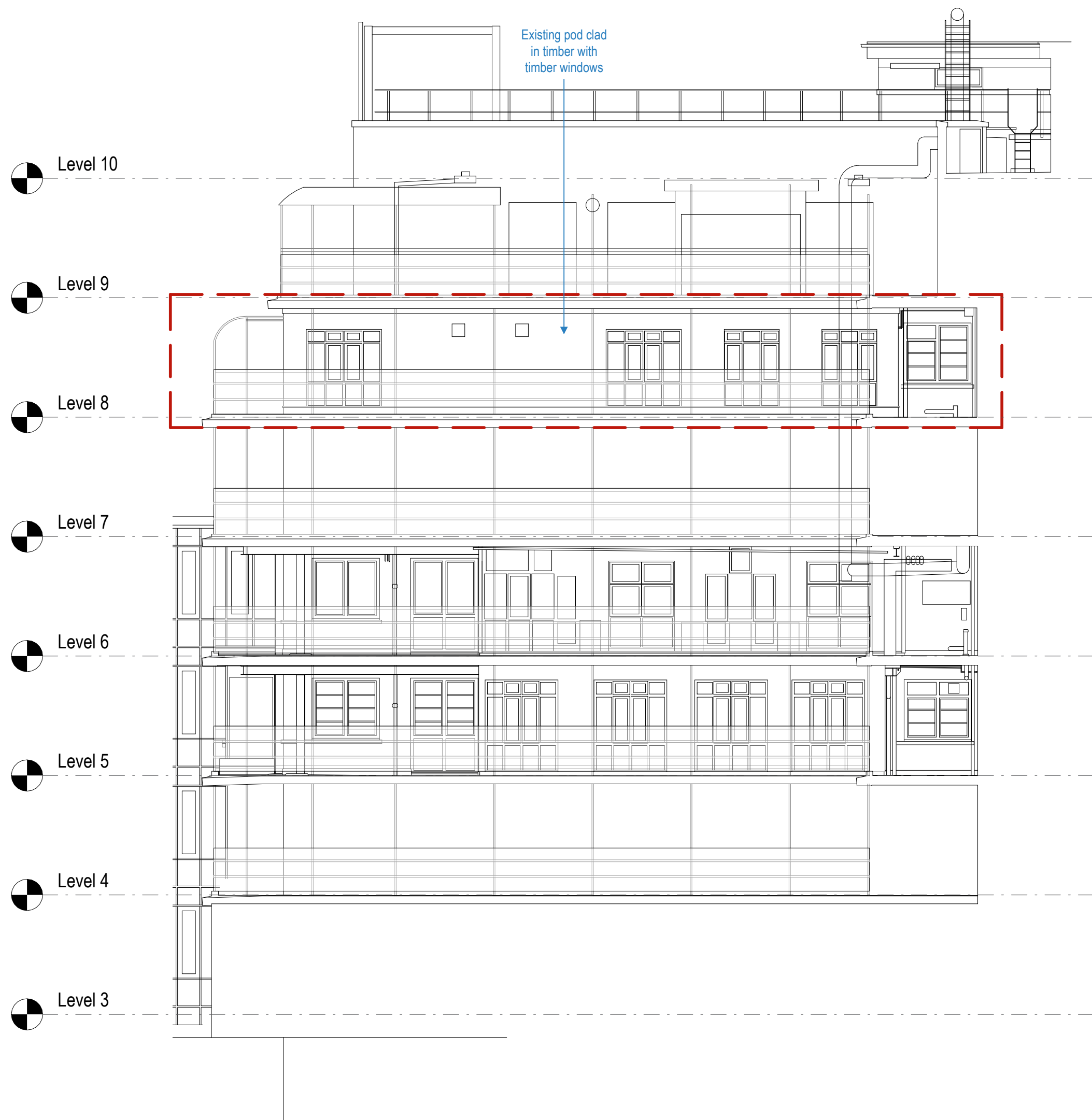
1 3053 East Internal Elevation 9 1 : 100