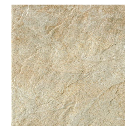
P05 Roma Natural