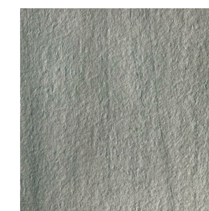
P08 Roma Lead