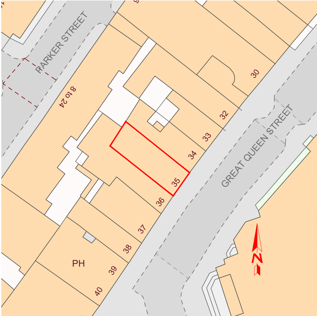
2 Block Plan Scale: 1:500

COPYRIGHT OF EDDISONS COMMERCIAL LTD ALL RIGHTS RESERVED. DRAWING NOT TO BE REPRODUCED WITHOUT EXPRESS PERMISSION. DO NOT SCALE FROM DRAWING EXCEPT FOR THE PURPOSE OF PLANNING AND ALL DIMENSIONS TO BE CHECKED ON SITE