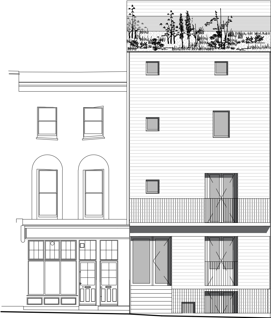
Royal College Street - Elevation