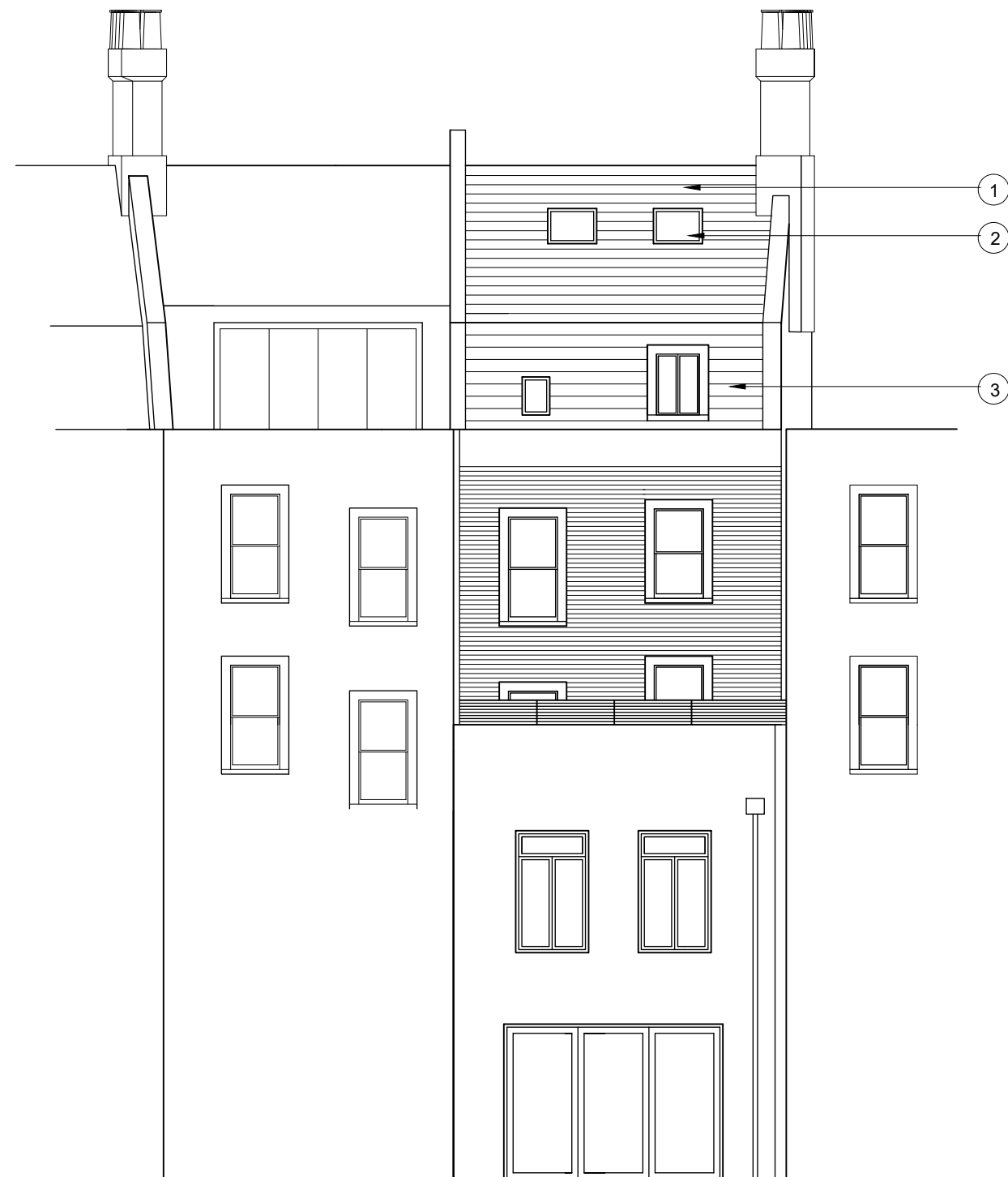
① REAR ELEVATION