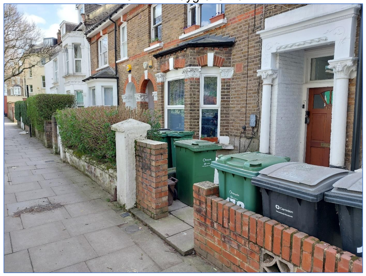
Photo 3: Privet hedge FG 172 Maygrove Road and location near to claim address