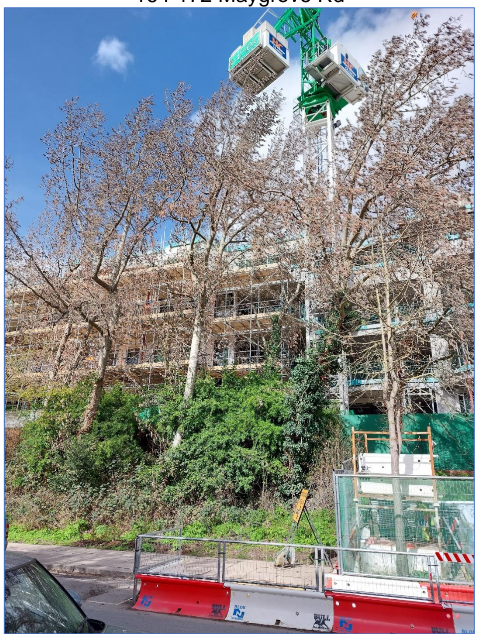
Photo 2: Aspen trees Seq 49, 53, 54 & 55 POS opp claim address; Ginkgo (Seq 17) in foreground