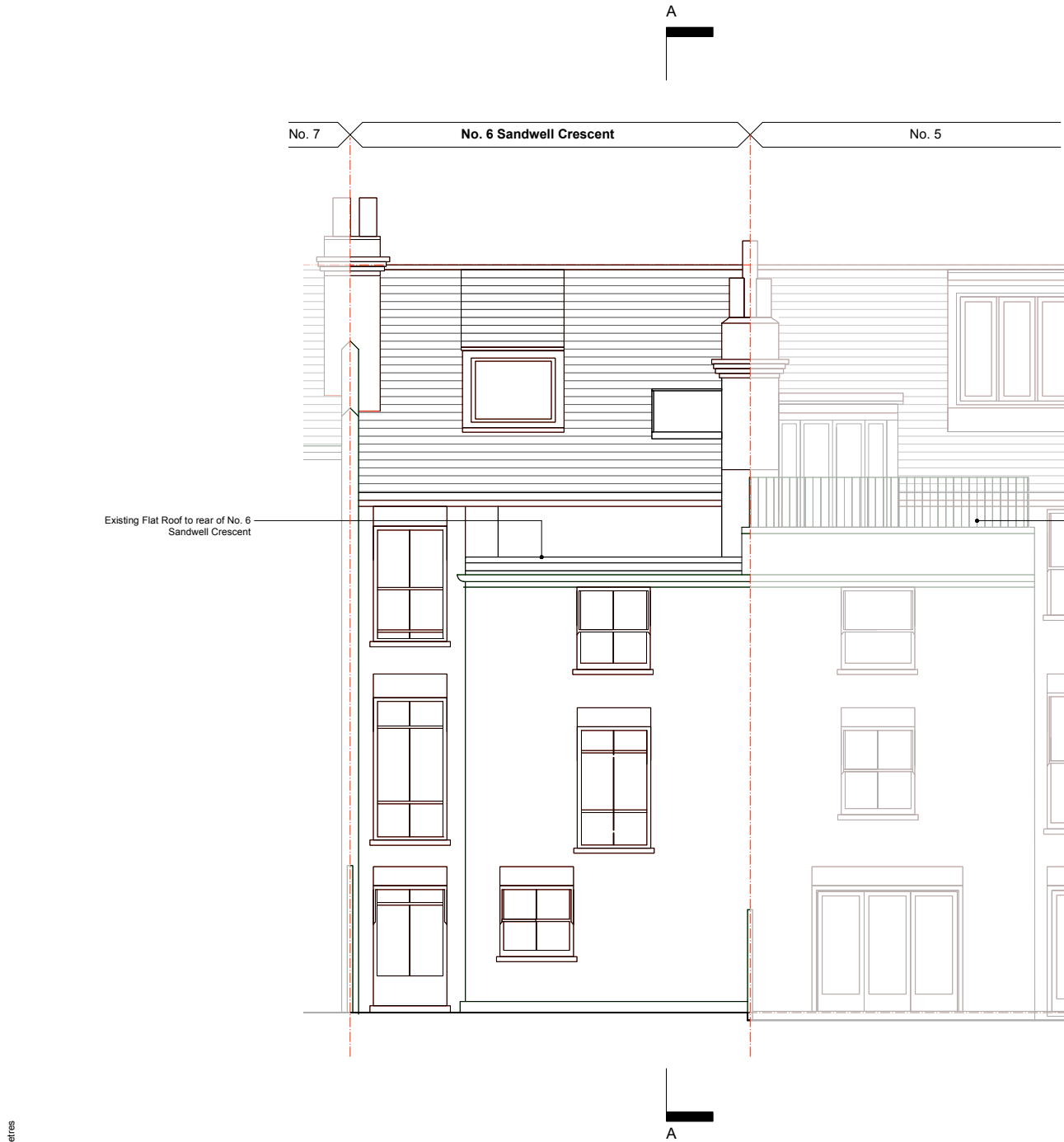
Existing Rear Elevation (1:50 @ A1 / 1: 100 @ A3)