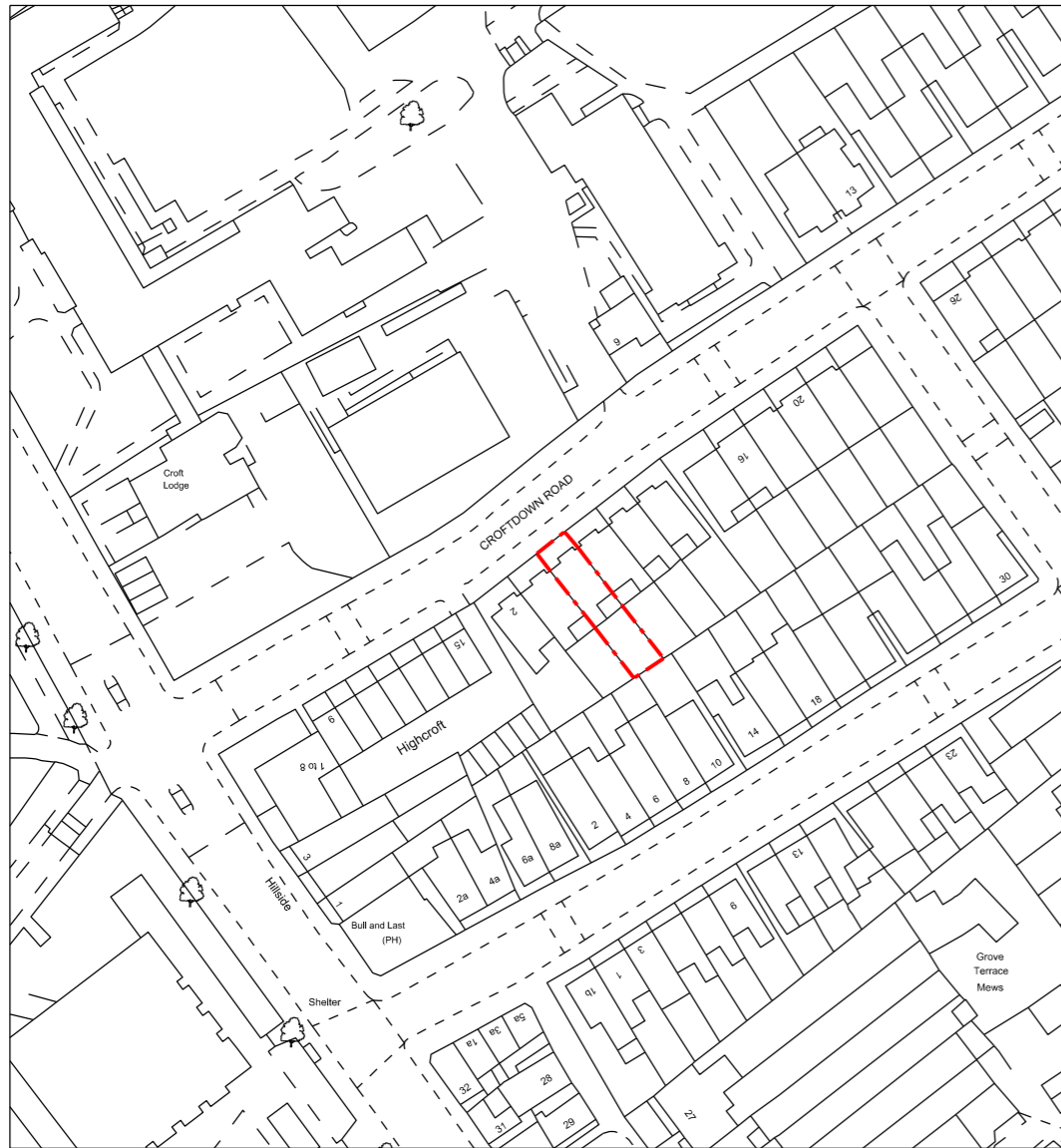
1 Location Plan Scale 1:1250@A3