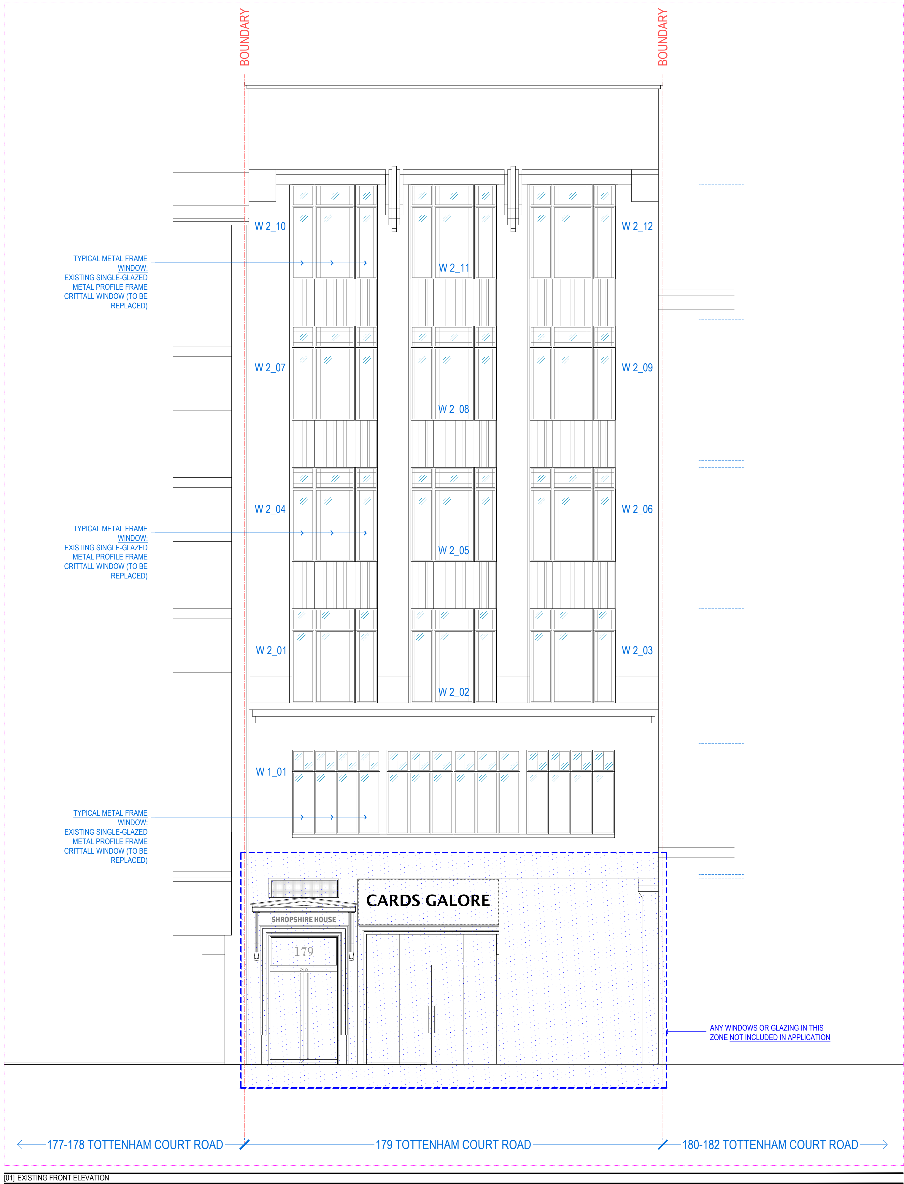
[01] EXISTING FRONT ELEVATION