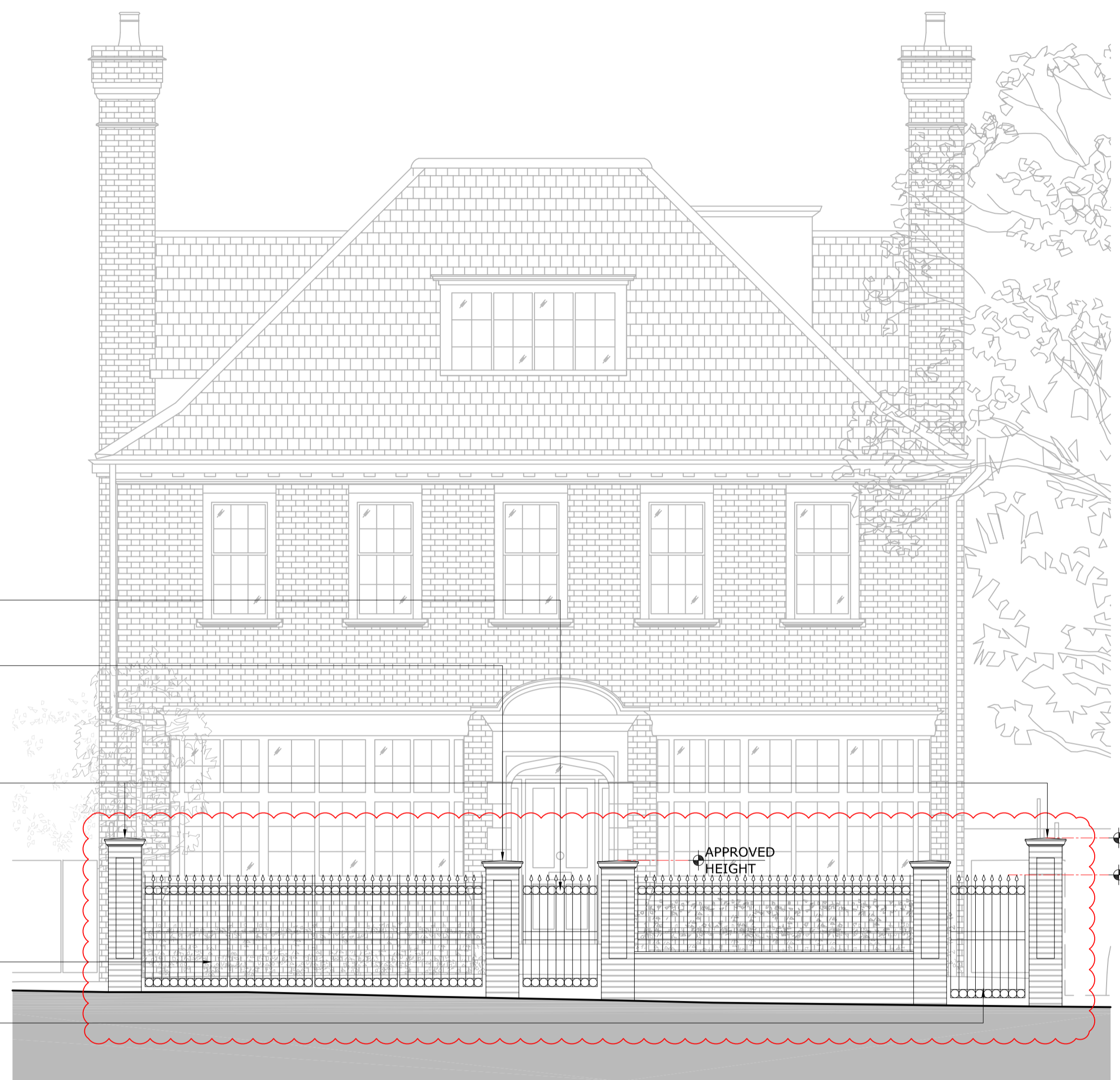
2 PROPOSED FRONT GATE ELEVATION 1:50@A1, 1:100@A3