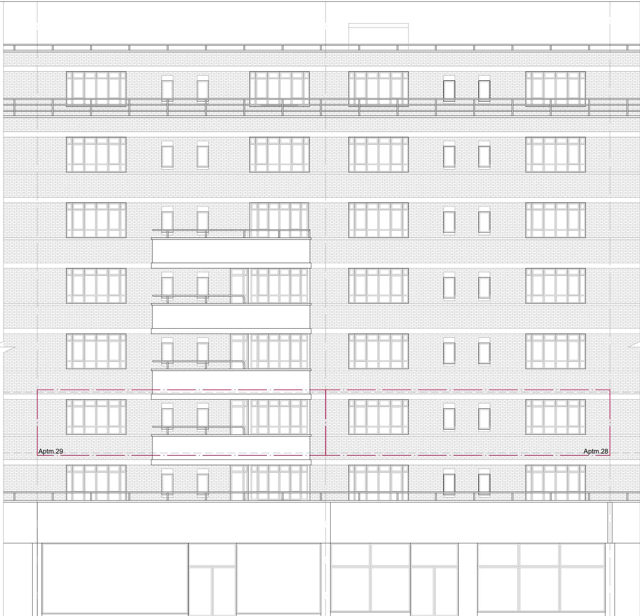
EXISTING ELEVATIONS FROM TOTTENHAM COURT ROAD