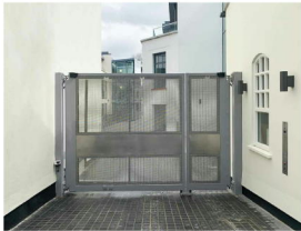
Previous image for reference only