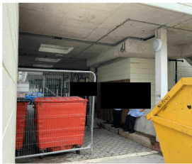
Existing rear access point, from Ainsworth Way