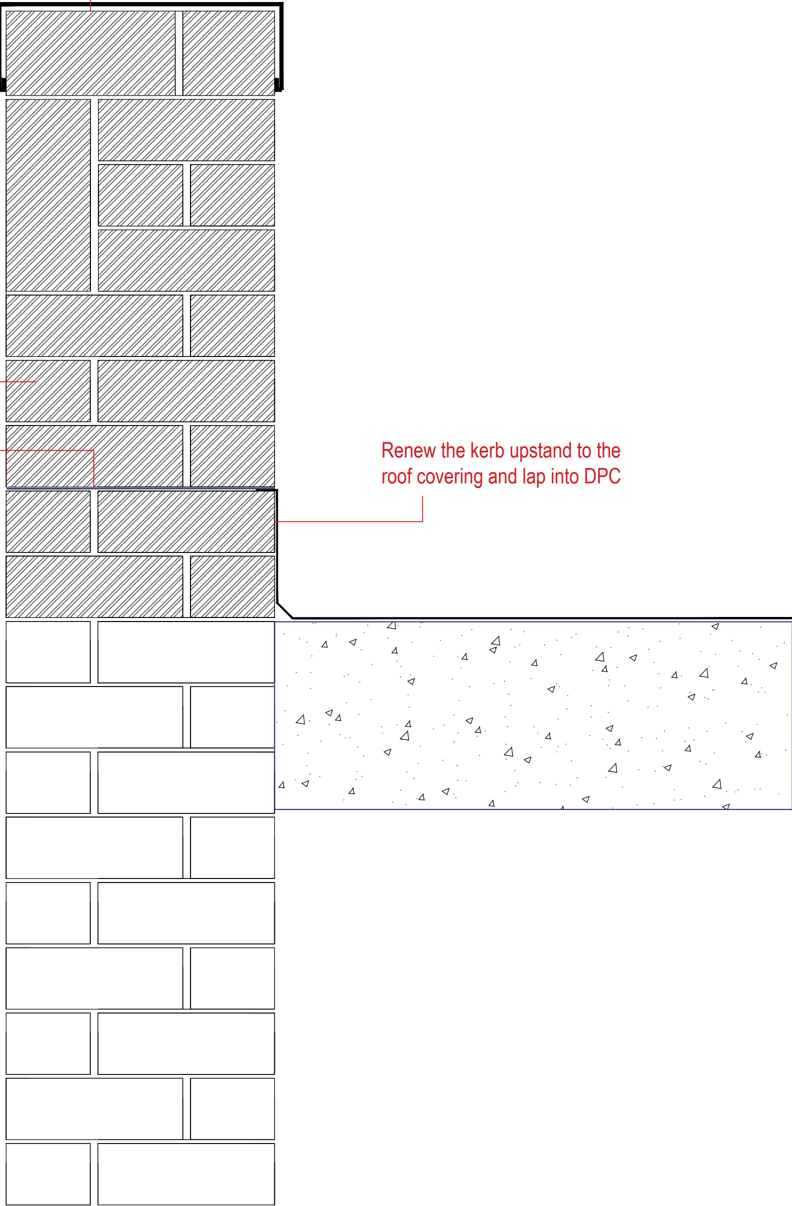
Proposed Parapet Section 1:10