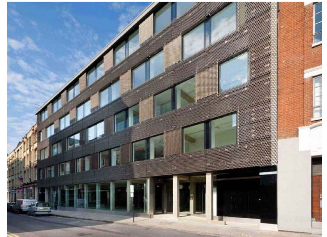
Great Sutton Street