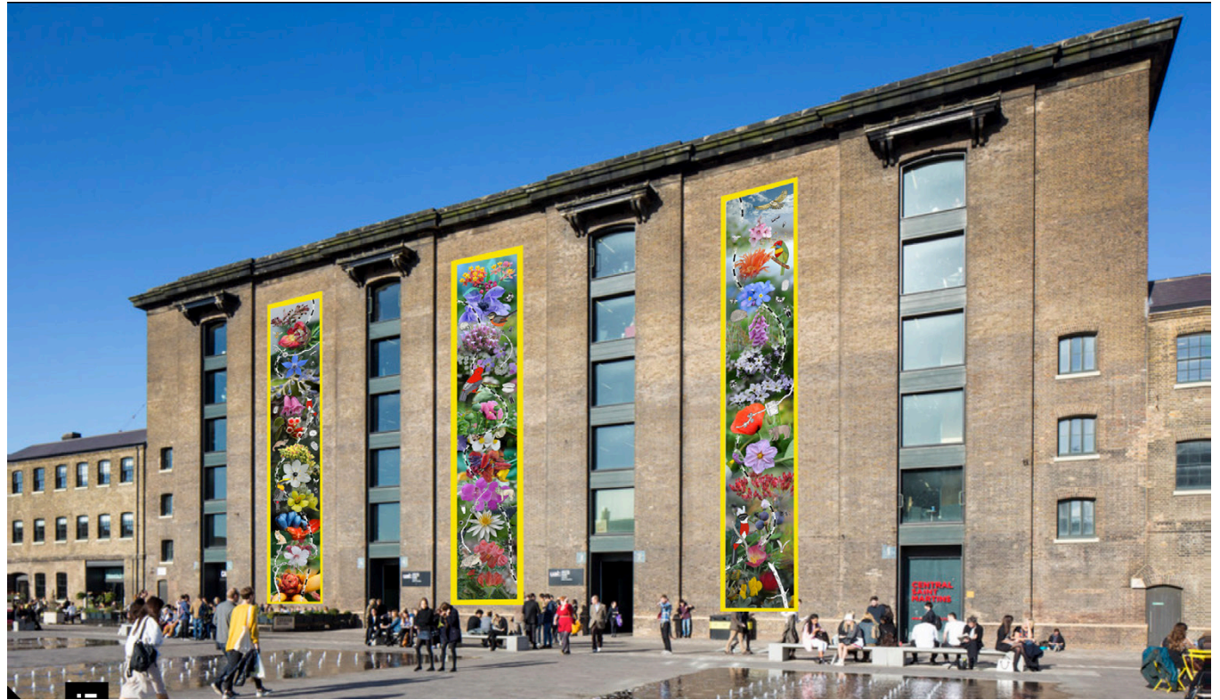
Lost Species Tapestries, render © Studio Orta 2022

Drawing from European tradition of tapestry since the 14c, soft fabric tableaux [wall hanging] depicting 'Lost Species' suspended along the facade of the Granary building.