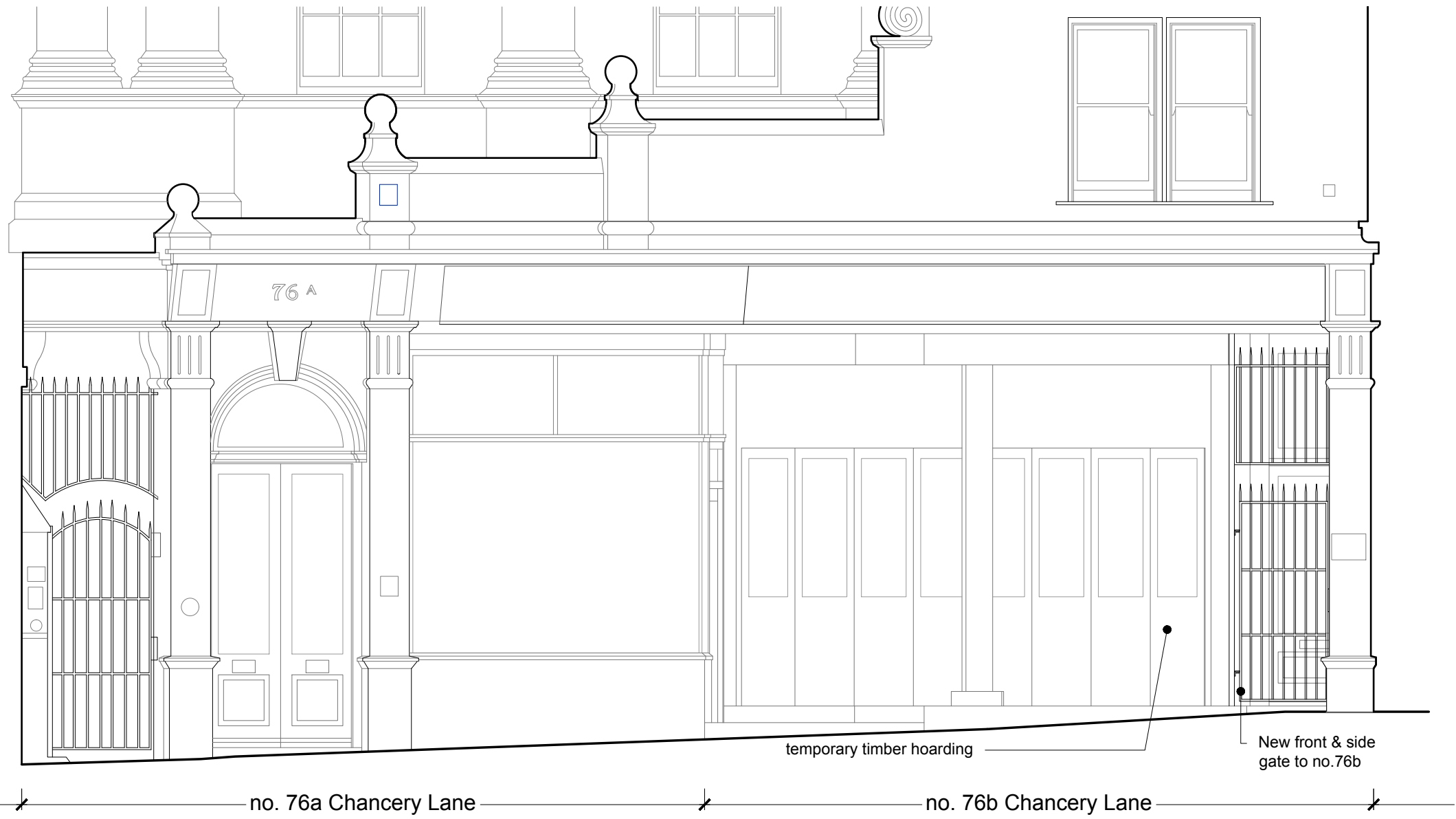
1. Proposed Chancery Lane East Facing Elevation Scale 1:50