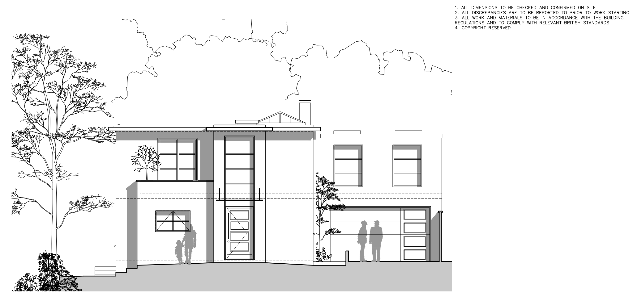
PROPOSED FRONT ELEVATION A-A SCALE 1:100 @ A3