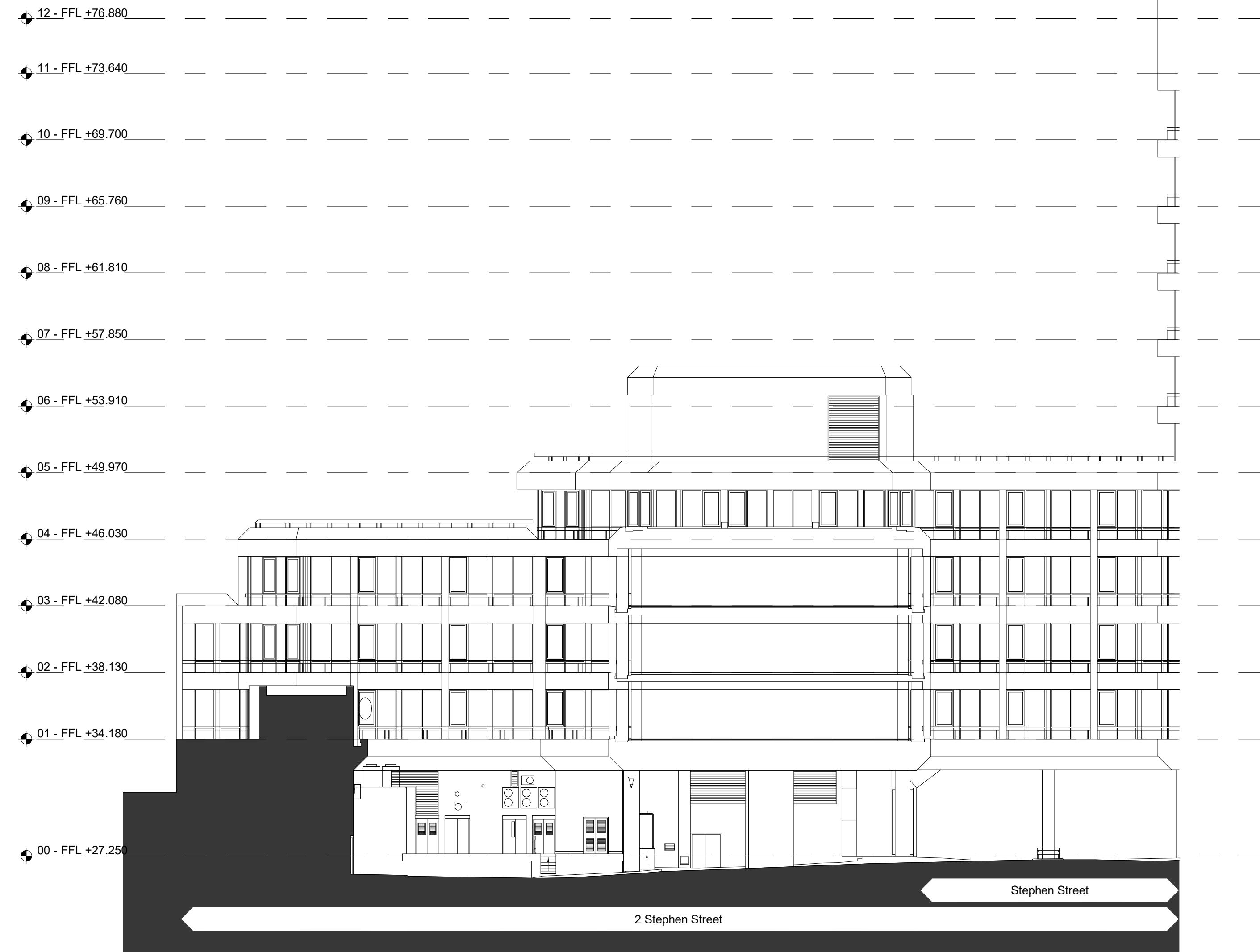
2 Existing 2 Stephen Street South West Elevation - Planning Scale: 1 : 200