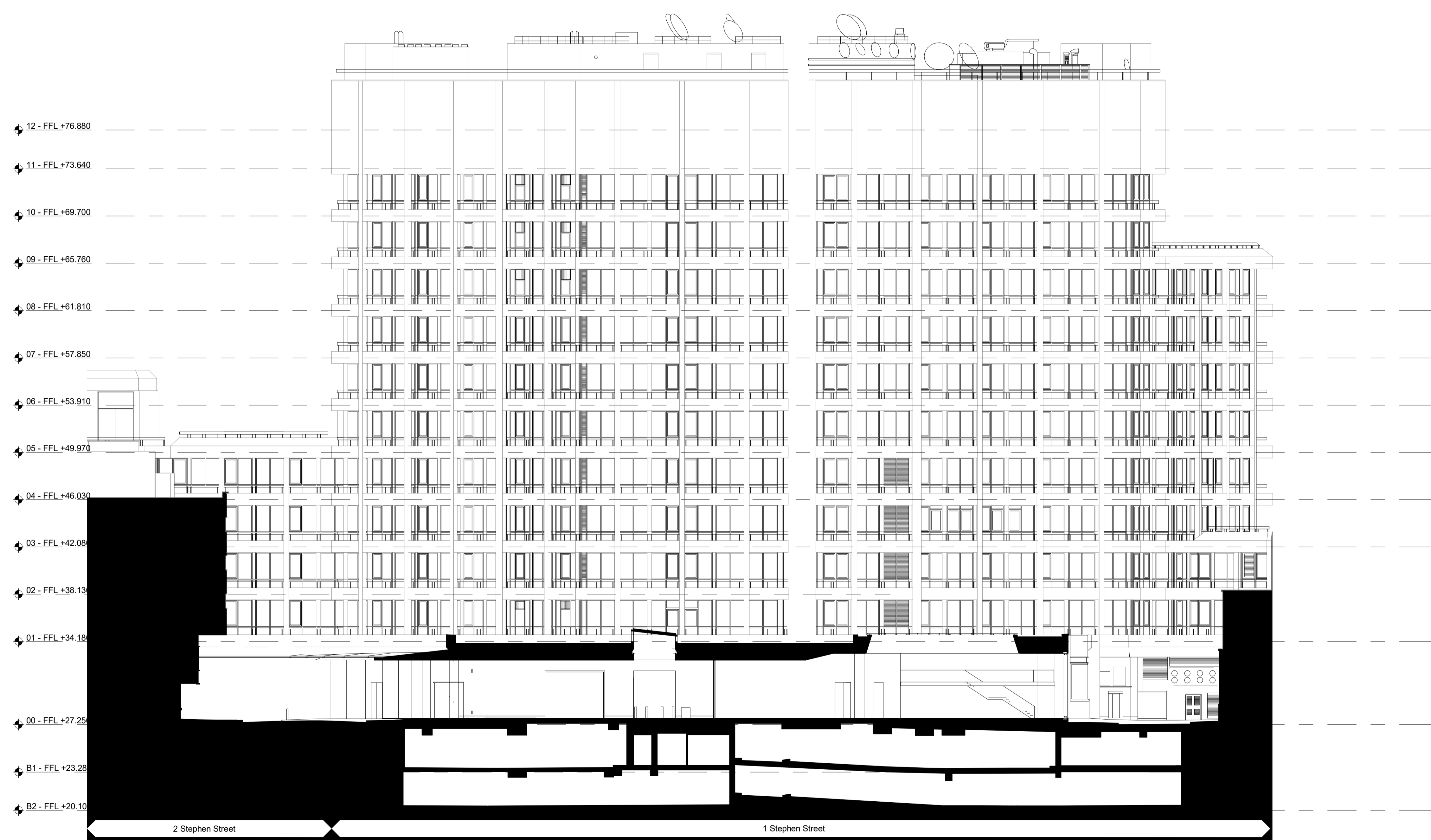
1 Existing South West Elevation - Planning Scale: 1 : 200