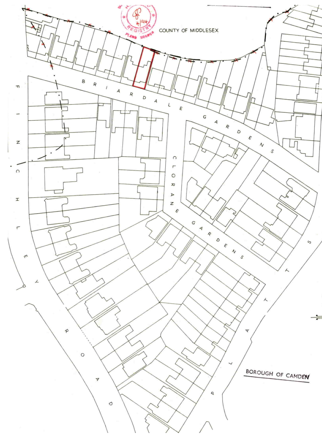
1 Site plan in location Scale: 1:1250