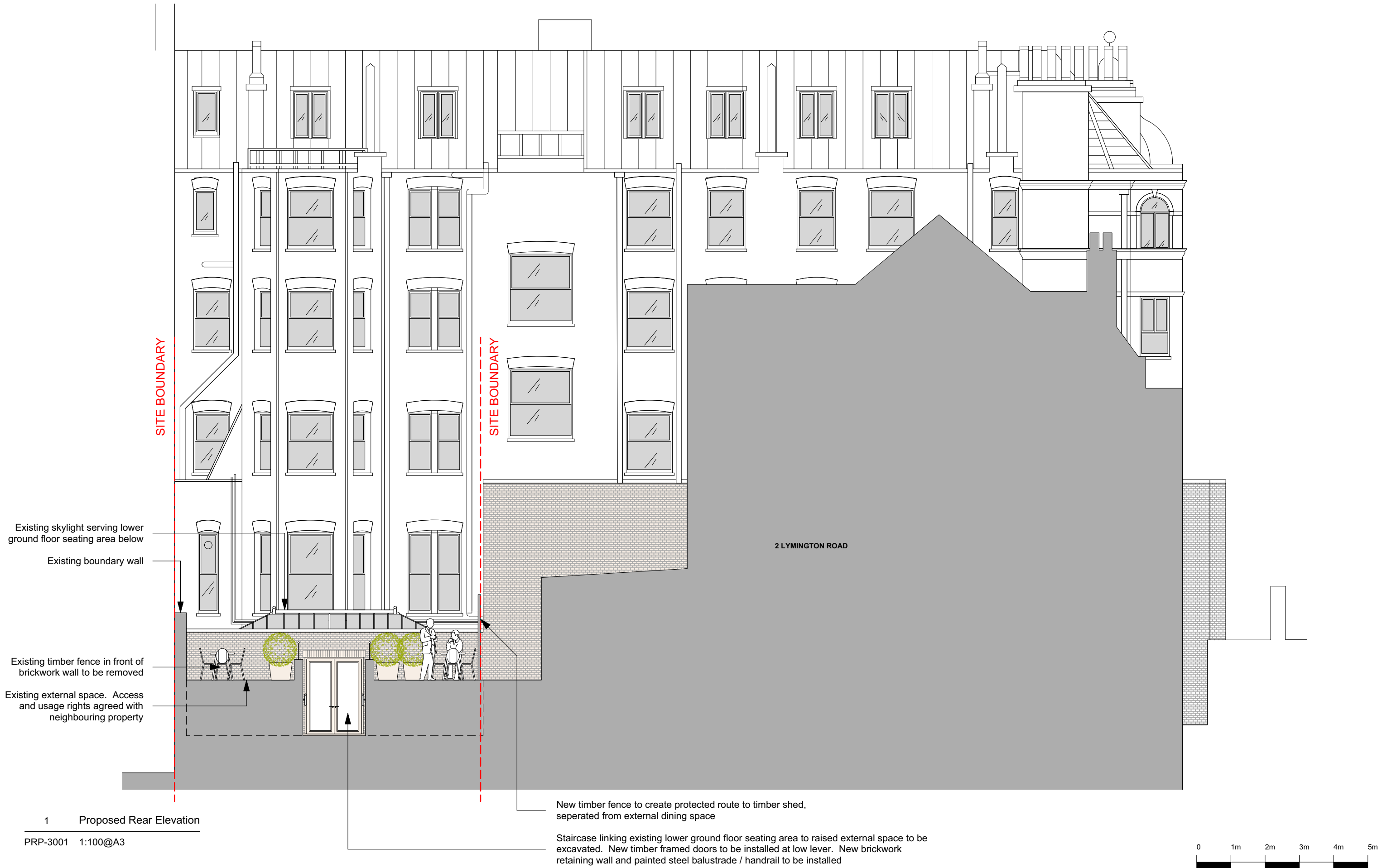
1 Proposed Rear Elevation