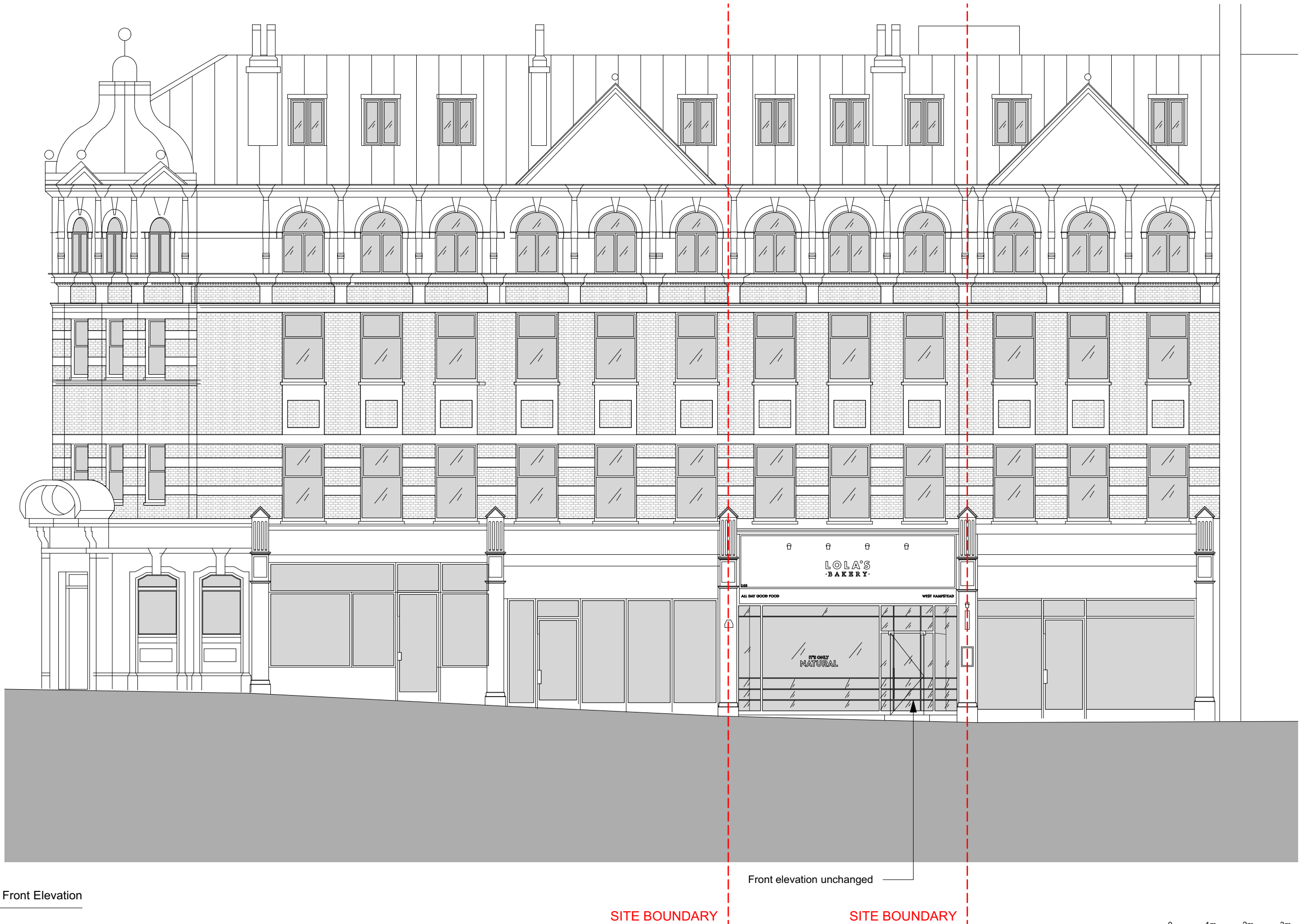
1 Proposed Front Elevation